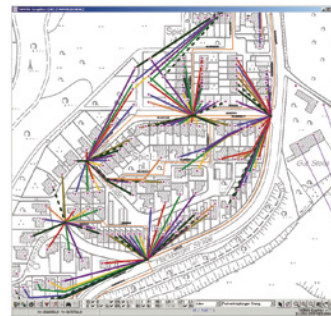
FTTH design with unique micro-pipe assignment

All designs and plans are created, supervised and revised with TANNIS planning and documentation software. TANNIS generates electronic online documentation which is handed over to the customer at the end of the project.